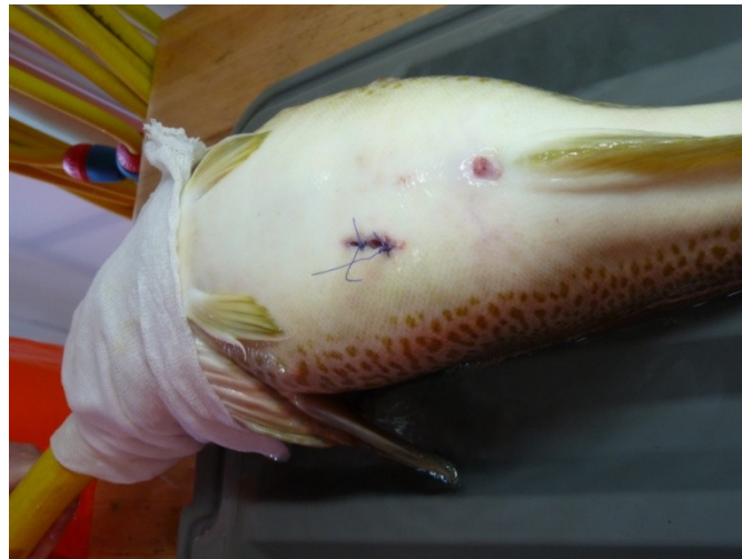
Figure 1: One of the study subjects showing the closed incision site where the DTS was surgically implanted into its abdominal cavity.

Four data storage tags were surgically implanted in four cods in the MRi experimental research station in Grindavík on the 30th of July 2009 (Figure 1). The cods were then placed in a tank which was 3 meters in diameter and the water level was 0,8 meters deep. The tags were configured to sense any sound over 130 decibels. Every second the tags would register a binominal signal: 1 if a sound was sensed or a 0 if no sound was sensed.