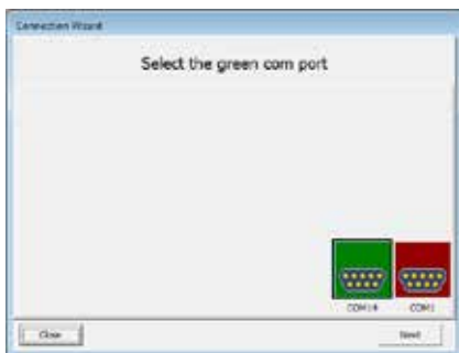
Figure 3.1 Connection wizard

The Connection Wizard is used for starting recordings and data retrieval. This wizard can be set to launch every time SeaStar is opened, but can also be accessed through the Wizards menu.