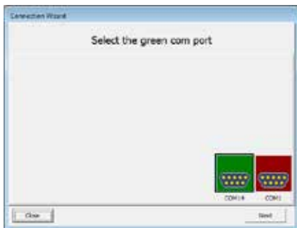
Figure 3.1 Connection wizard

The Connection Wizard is used for starting recordings and data retrieval. This wizard can be set to launch every time SeaStar is opened, but can also be accessed through the Wizards menu.