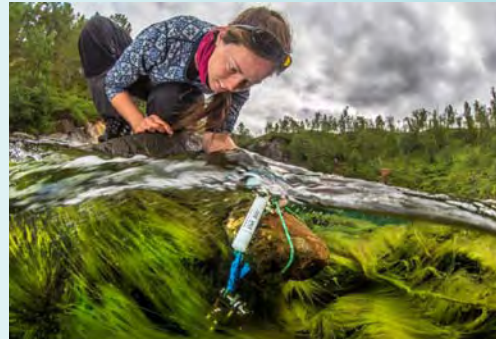
Starmon mini deployed in a river